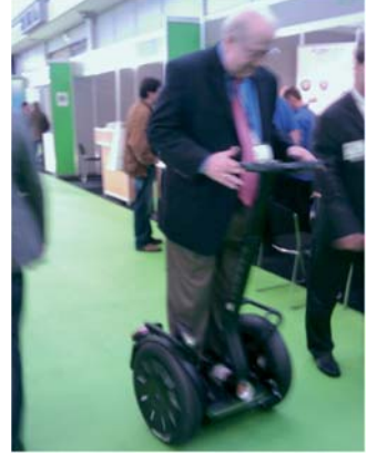
...all the best for the future!

8 million Euro building already under construction next to the Bayreuth University Campus: the future home of our European Remanufacturing Technology